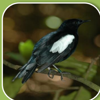
Seychelles Magpie-robin (Pi Santez) Copsychus sechellarum