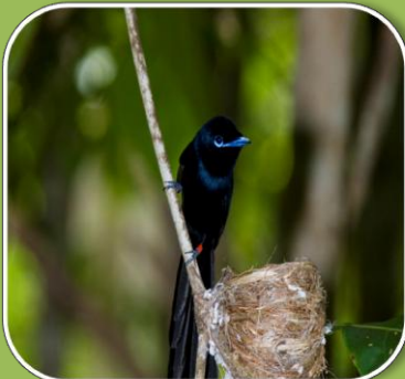
Seychelles Black Paradise Flycatcher (Vev) Terpsiphone corvina

Seychelles boasts 12 unique birds species, which are found only in Seychelles. Here are the four unique birds which are listed as endangered by IUCN (the World Conservation Union). The Seychelles Black Paradise Flycatcher is critically endangered.