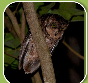
Seychelles Scops Owl (Syer), Otus Insularis