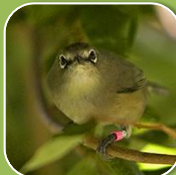
Seychelles White-eye (Zwazo Linet) Zosterops Modestus